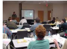
New River Room